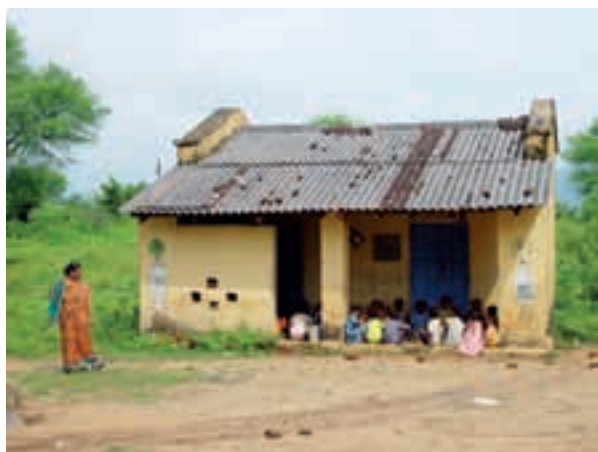
More children are being sent to school